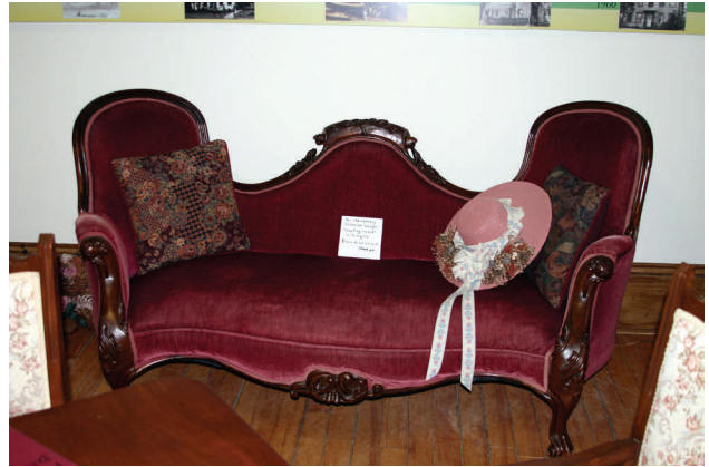
A 19th century courting couch donated to the RTHS for the Dickinson House.