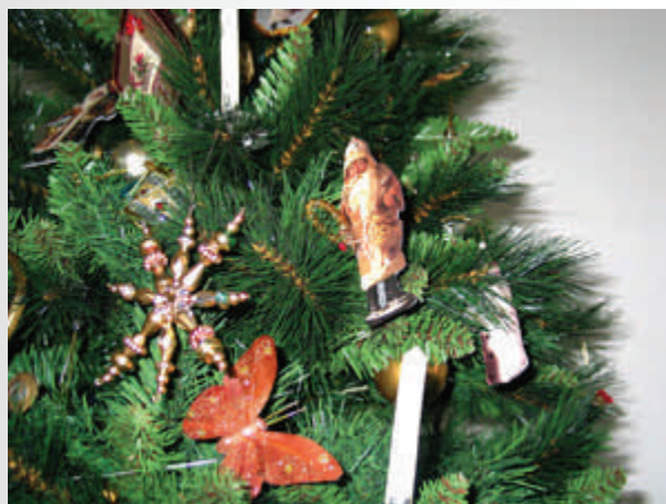
Christmas Tree at the Dickinson House